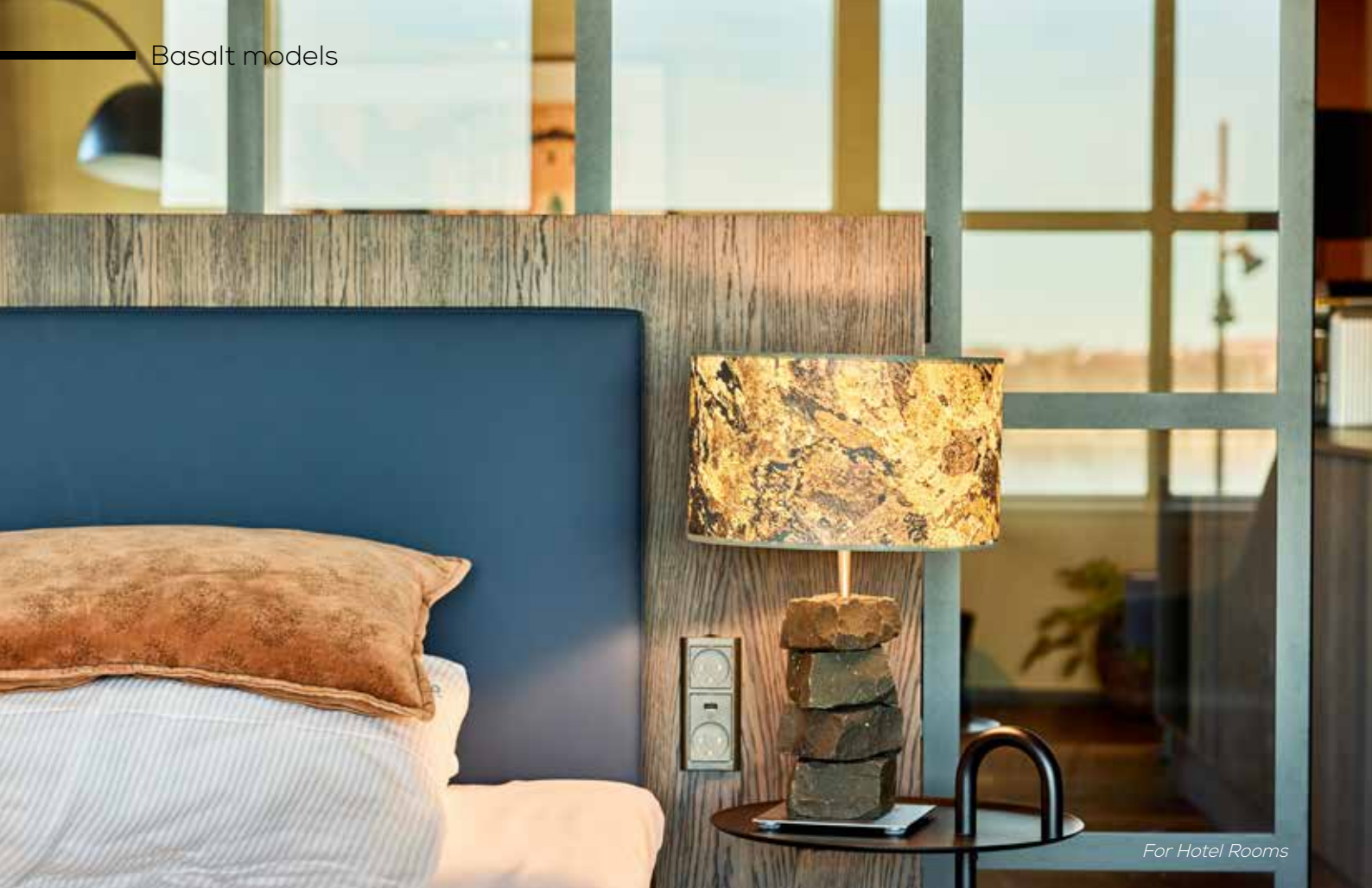
For Hotel Rooms